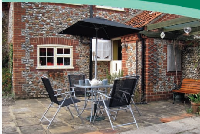
Location of Oaktree Cottage

Oaktree Cottage is located on the edge of Briston village, and is ideally situated to explore the coast, towns, and countryside of North Norfolk. The cottage sleeps four people in two bedrooms, and has a well equipped kitchen, comfortable lounge with a wood-burning stove, and a small enclosed garden with a summerhouse.